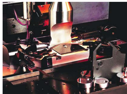
The automated "Shuttle" Ultrasonic Welding