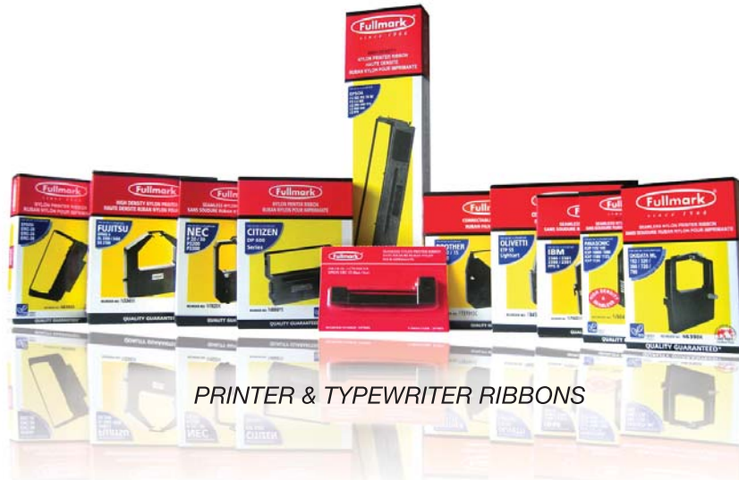
PRINTER & TYPEWRITER RIBBONS

Fullmark's extensive range of products provide premium and satisfied quality to industrials, corporates, SOHO and home users.