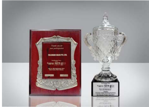
Best Innovative Product Award, Stationery Asia Fair 2011, Mumbai, India