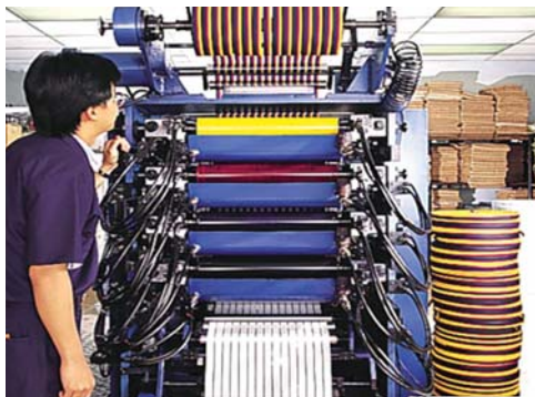
One of three such Inking Machines in the world