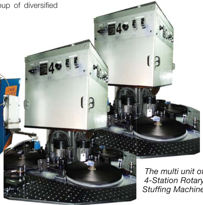
The multi unit of 4-Station Rotary Stuffing Machines