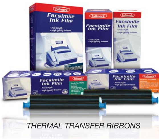
THERMAL TRANSFER RIBBONS