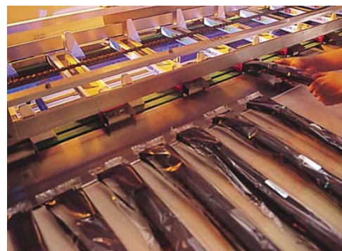
Automated Packing System