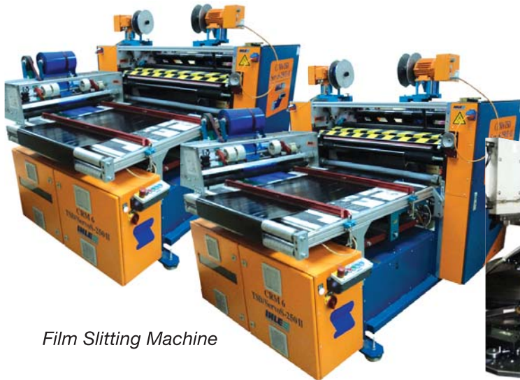
Film Slitting Machine

Registered in 1967, Fullmark has come a long way since its modest beginning as a biro pen manufacturer to become a group of diversified companies, each with its distinct operations.